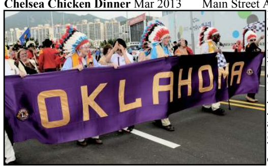
Lions Parade in Busan

District Convention Nov 17 2012 3-O Cabinet Meeting Nov 17 2012 3-O Cabinet Meeting Mar 9 2013 Chelsea Chicken Dinner Mar 2013